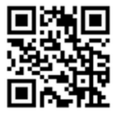
SCAN WITH YOUR PHONE OR CHROMEBOOK CAMERA